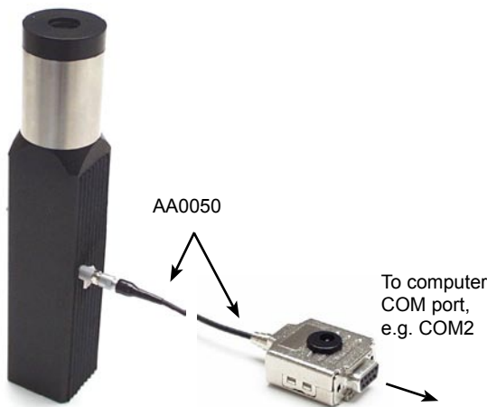
Fig. 2 Pistonphone connection for use with a computer

There is no flow control/handshaking; therefore commands must be sent one by one, waiting for each response.